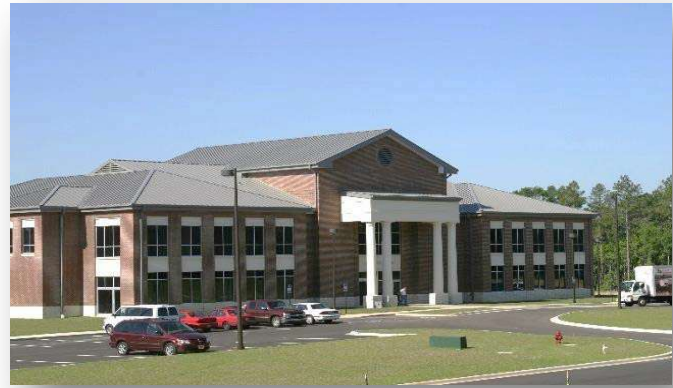
Florida Public Safety Institute Pat Thomas Law Enforcement Academy