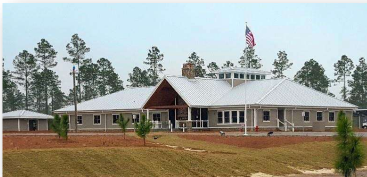
Wakulla Environmental Institute