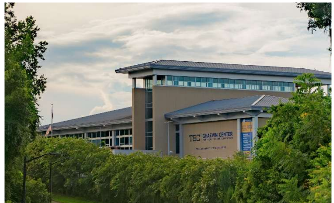
Ghazvini Center for Healthcare Education

During business hours, the TSC campus is open to students, parents, employees, contractors, and guests. During non-business hours, access to campus facilities is restricted to those with issued keys and to those admitted for access by TSCPD after verification of identity and authorization.